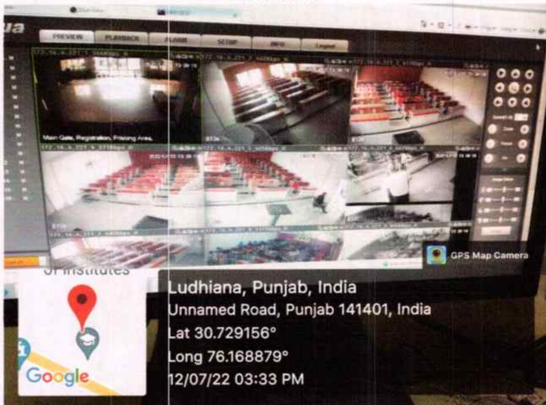
CCTV Camera View