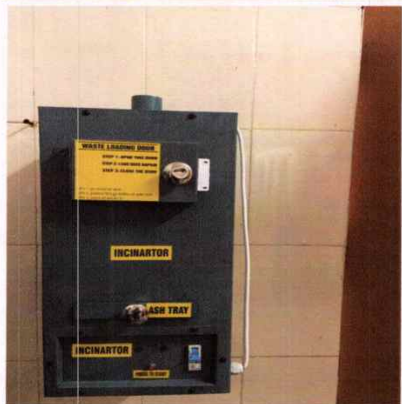
Incinerator at Girl's Hostel