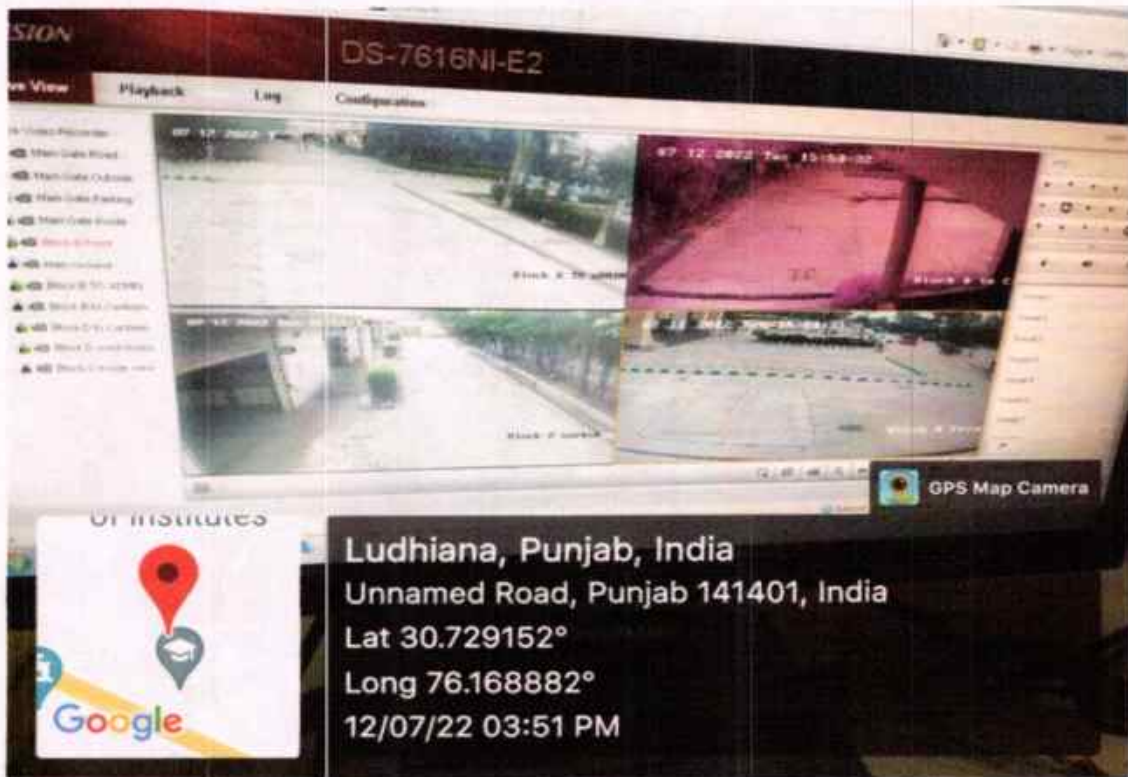
CCTV Camera View